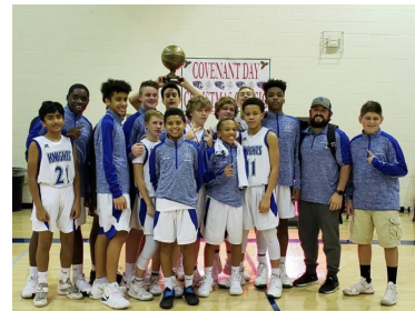
MS boys' basketball team

Click here to see a schedule of all upcoming Athletic events.